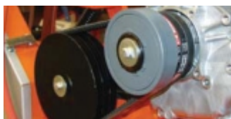
AMBREAJ CENTRIFUGARE (DOAR JUMBO P13)