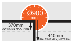
ADANCIME MAX. TAIERE - JUMBO 900