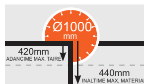
ADANCIME MAX. TAIERE - JUMBO 1000